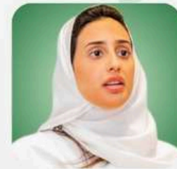
HH. PRINCESS ABEER AL SAUD SPEAKER